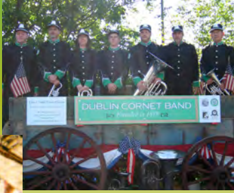
Dublin Cornet Band; reprising its role as village entertainers and musical ambassadors to other villages and cities, the Dublin Cornet Band first founded in 1879.